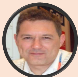
GM Miguel Illescas Tactical World