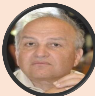
GM Alexander Beliavsky Opening Preparation