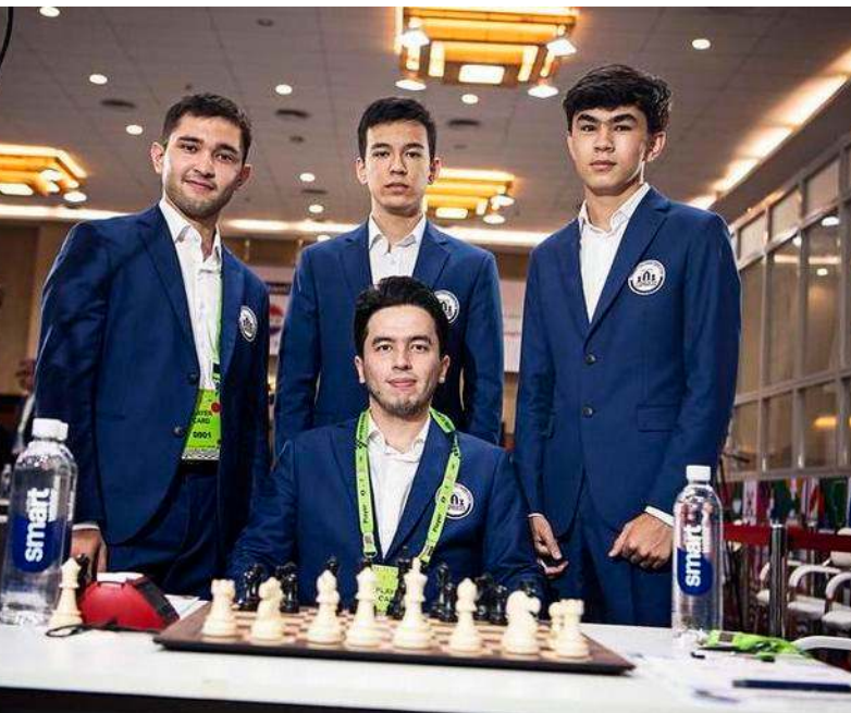
Team Uzbekistan; Photo by: FIDE/Stev Bonhage