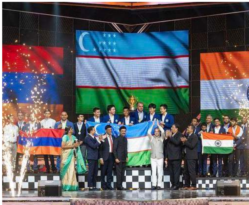
Closing ceremony; Photo by: FIDE/Lennart Ootes