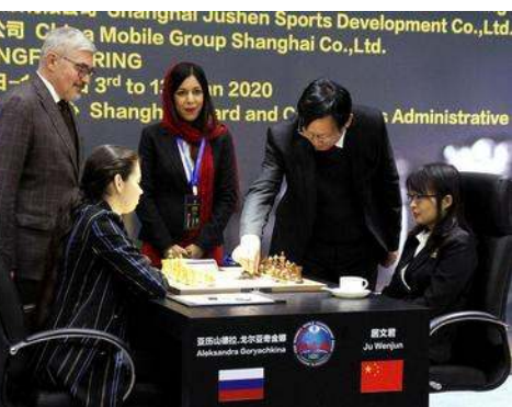
Opening of the 1st game