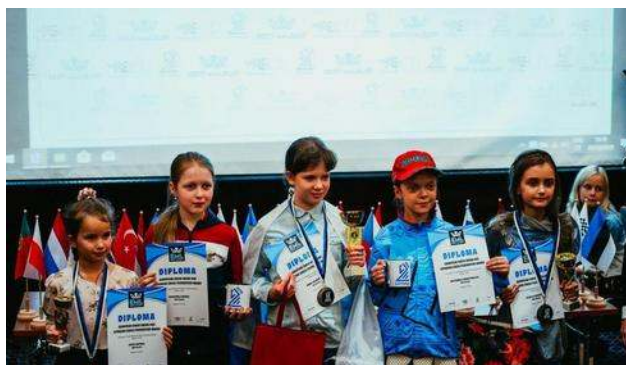
A moment from the Closing Ceremony of the event