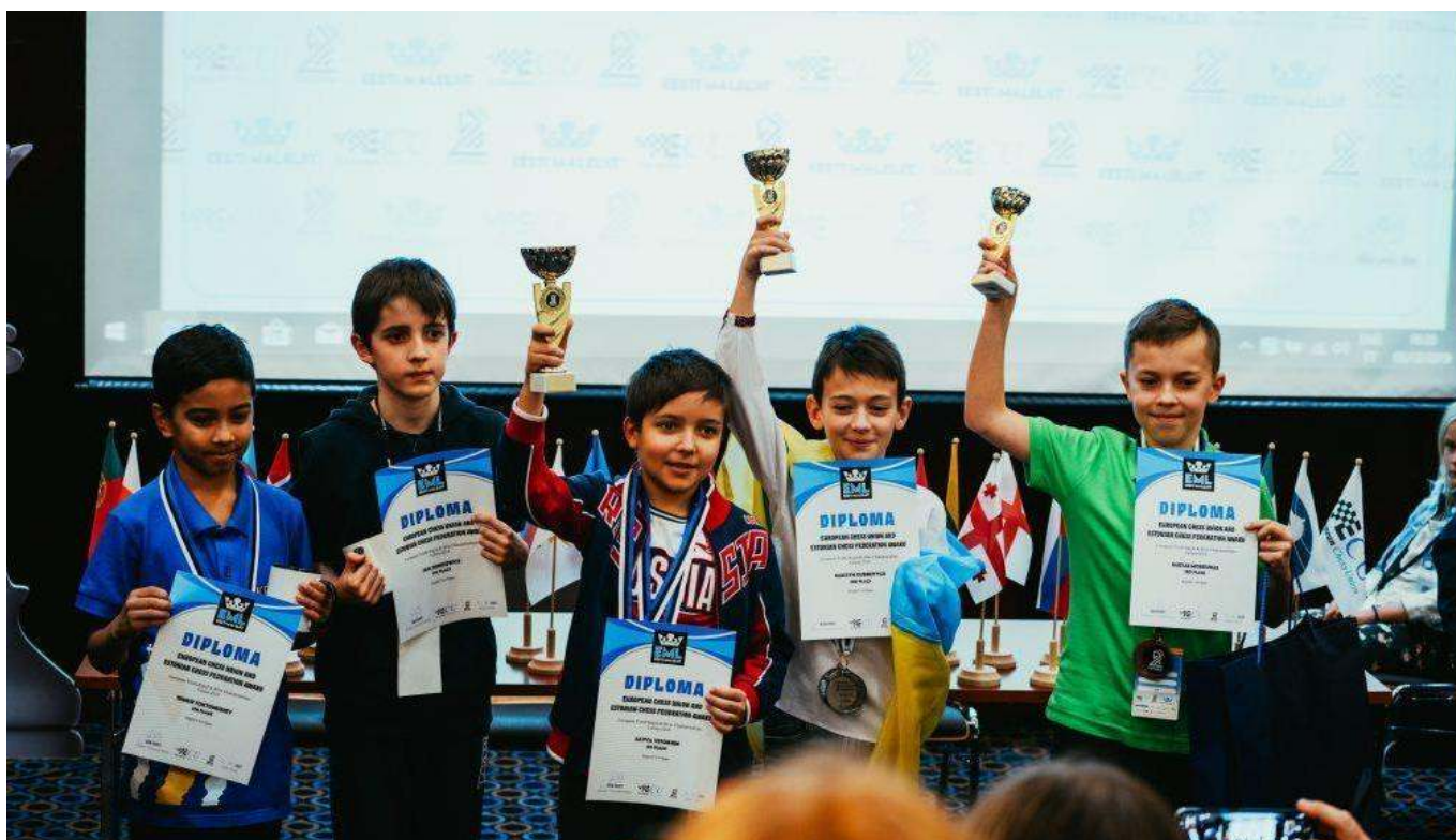
Playing venue capture

Championship 2019, took place at the Sokos Hotel Viru Tallinn, in Estonia, from 30th November- 4th December 2019.