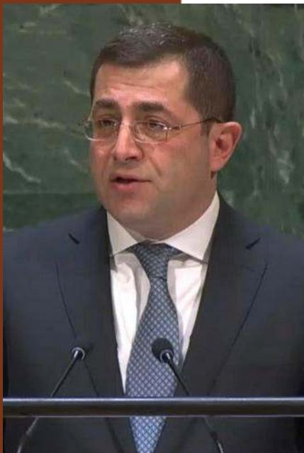
Armenia's delegate represents the resolution

The official UN Press release is available on the following link.