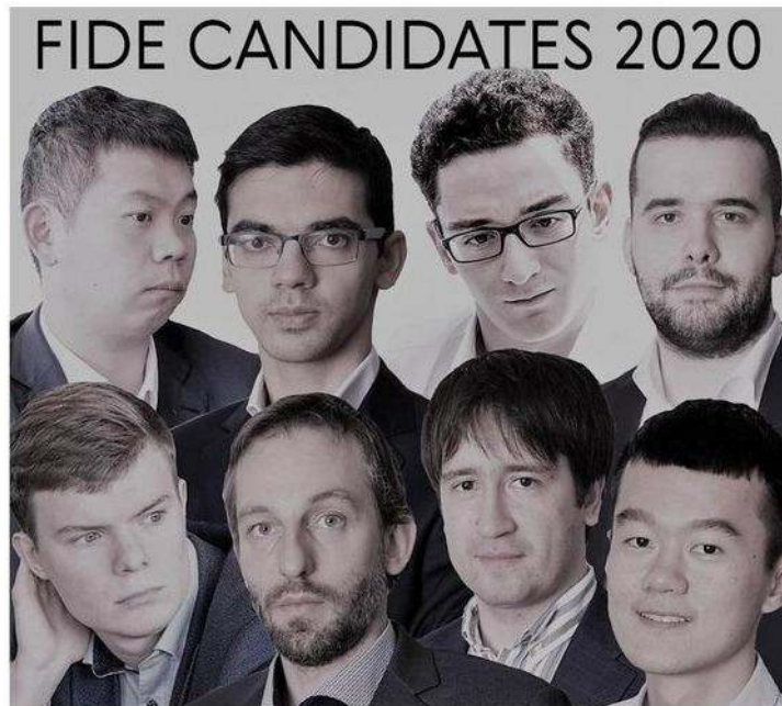
Participants of the FIDE Candidates Tournament 2020