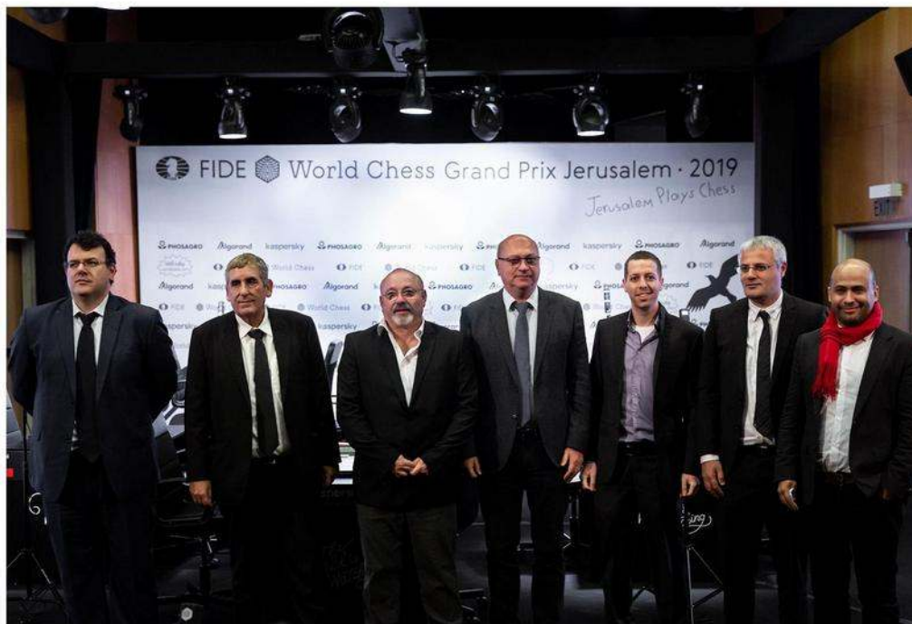
Opening ceremony of the event

The event participated 16 Grandmasters: Topalov Veselin (BUL, 2737), Vachier Lagrave Maxime (FRA, 2780), Jakovenko Dmitry (RUS, 2698), Mamedyarov Shakhriyar (AZE, 2772), Giri Anish (NED, 2769), Wei Yi (CHN, 2725), Gelfand Boris (ISR, 2684), Nepomniachtchi Ian (RUS, 2767), So Wesley (USA, 2760), Yu Yangyi (CHN, 2738), Wang Hao (CHN, 2756), Navara David (CZE, 2707), Karjakin Sergey (RUS, 2754), Harikrishna Pentala (IND, 2724), Andreikin Dmitry (RUS, 2724), and Wojtaszek Radoslaw (POL, 2725).