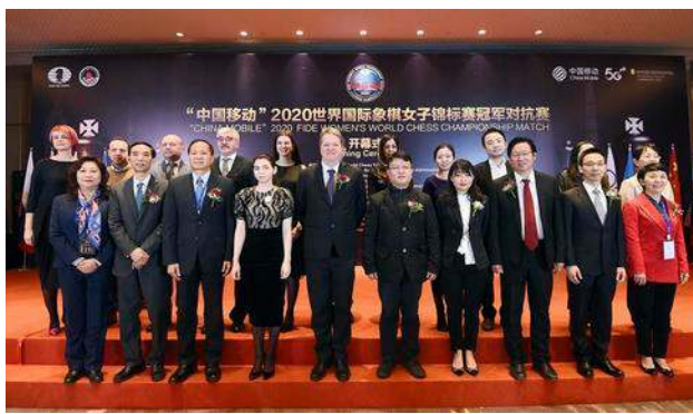
Opening ceremony of the event