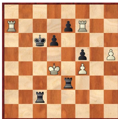
Greenfeld-Bacrot, ECC Bilbao 2014