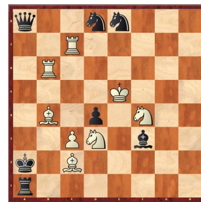
Study No. 1