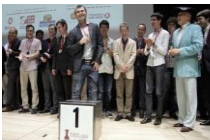
SOCAR winner in Open section

Nevertheless, both clubs finished the tournament with all 7 wins and convincingly triumphed.