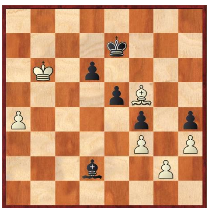
Topalov-Svidler, ECC Bilbao 2014