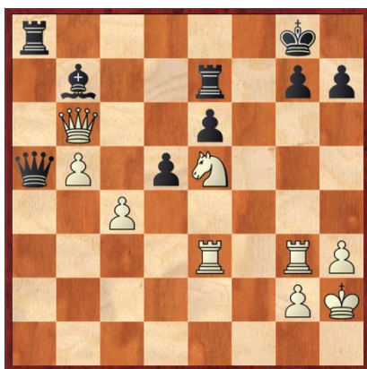
Shirov-Vadder, ECC Bilbao 2014