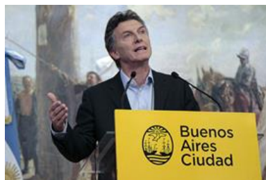
Ing. Mauricio Macri - Governor of Buenos Aires, Argentina