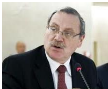
Dr. Ricardo Erlich - Minister of Education and Culture of Uruguay

During the visit, on 18th of March, they will meet with the Ministers of Education and Sport of Uruguay, Dr. Ricardo Erlich and Mrs. Lilian Kechichian.